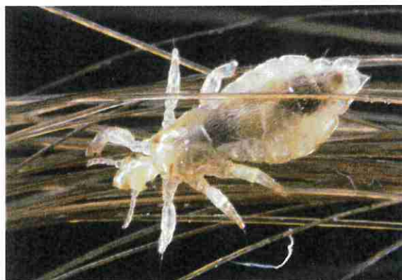
(Not to scale)

Bites from head lice can cause intense itching and irritation on the scalp, but these symptoms may not appear until at least two months after the lice move in. A rash at the nape of the neck may also develop.